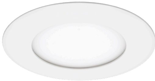
4" Brio Disc - Round BRD4-30-RD (3000K / 600Lm / 9W)