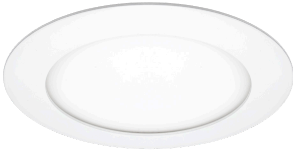
6" Brio Disc - Round BRD6-30-RD (3000K / 850Lm / 12W)